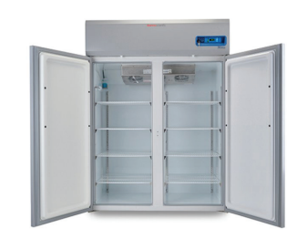
TSX Series large-format freezer (Cat. No. TSX5030FA)